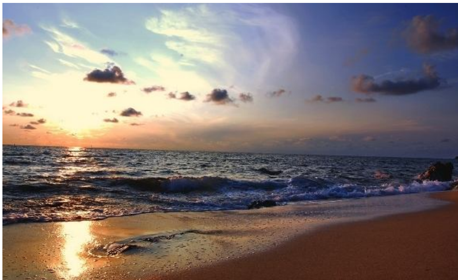
Desaru Beach, Malaysia

Destination Resorts was formed by the Malaysian Government to develop premier resorts and hotels to enhance Malaysia's tourism portfolio.